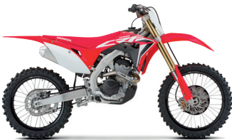
20YM information and photos